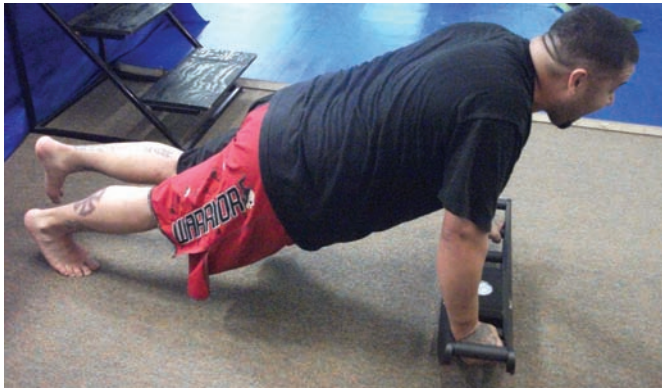
STATION 7 BodiRocker push ups w/ one leg on ground