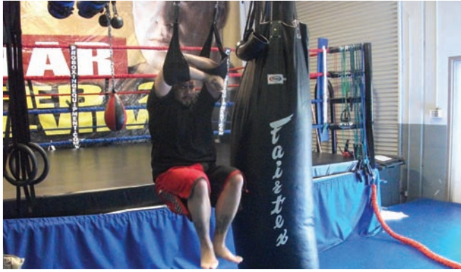
STATION 5 Hanging Abs (bring your knees to your chest and back down)