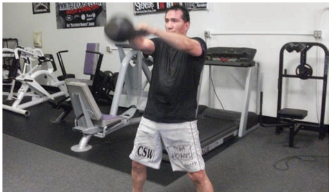
STATION 10 Two Hand Kettle Bell Swing