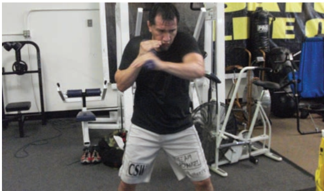
STATION 9 2lb Dumbbell Shadow Box